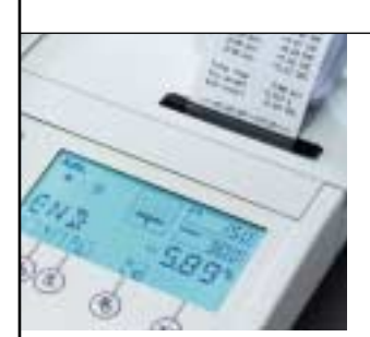
Read and/or print the result.