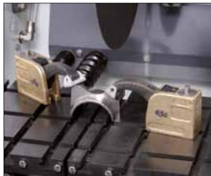
50613 KOPAL holders.