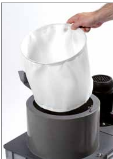
TANK WITH FILTER Tank and pump with removable filter