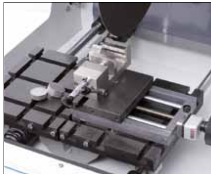
51610 + 51319 Transversal table + Quick clamping vice (right).