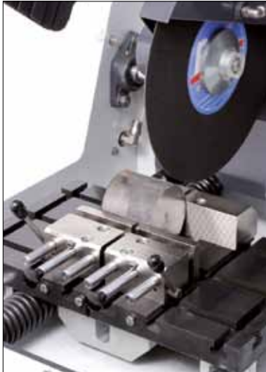
50906 Double quick clamping vices.