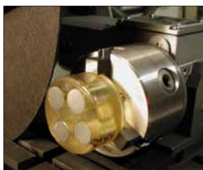
51610 + 51330 Transversal table with rotating holder.